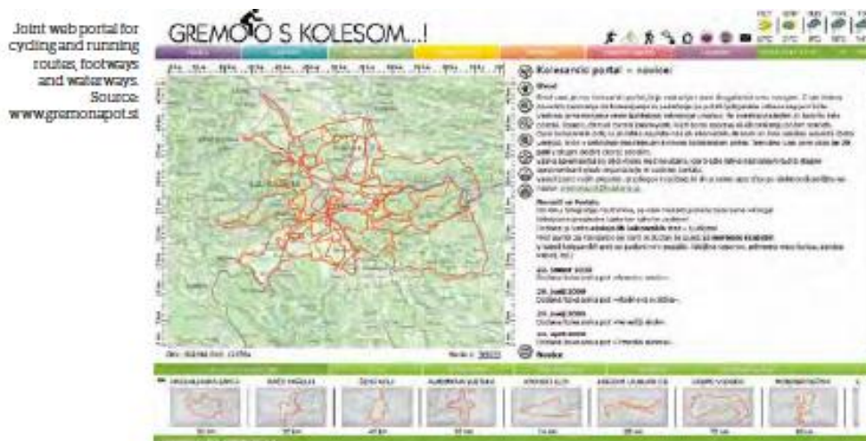
Figure 2: Bike portal of the region from Public Transport in the Ljubljana Urban Region, Regional Development Agency of the Ljubljana Urban Region (RDA LUR), Ljubljana, April 2010